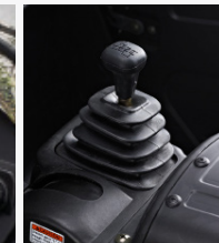
4WD WITH HI/LO