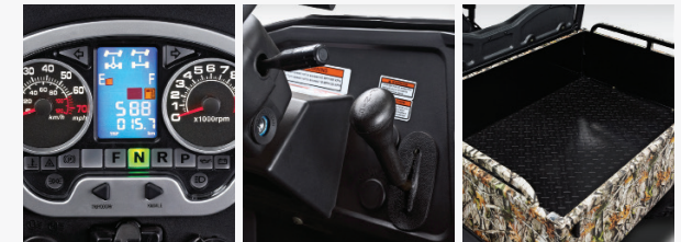
INSTRUMENT DISPLAY 4-WHEEL DRIVE CARGO BED